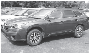
2020 Subaru Outback AWD, moon roof, huge screen, 173 K miles. $17,495 As low as $276 a month