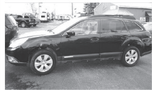
2010 Subaru Outback AWD, 5 speed, 220 K miles $6,995 As low as $199 a month

6585 M-66, Charlevoix MI • 231-547-9624 www.bergmanncenter.org