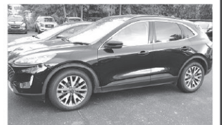
2020 Ford Escape Titanium Hybrid, leather, rear camera, 77 K miles. $21,995 As low as $345 a month