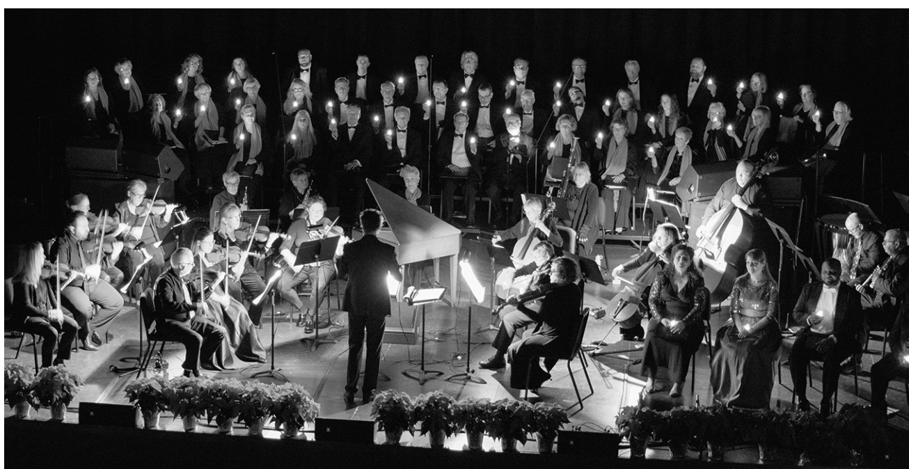
MESSIAH BY CANDLELIGHT