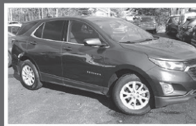
2019 CHEVY EQUINOX LT • 126 K miles.