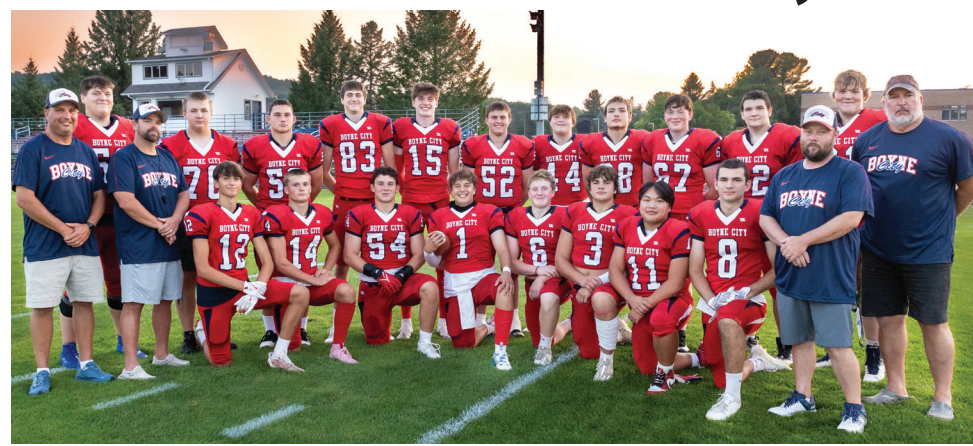
BOYNE CITY VARSITY FOOTBALL TEAM

But that's where the losses stopped. Boyne City is on an eight-game