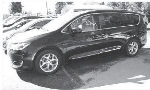
2019 Chrysler Pacifica 4 captain seats, Stow-N-Go, rear camera, leather, 96 K miles. Very Nice! $21,595 As low as $339 a month