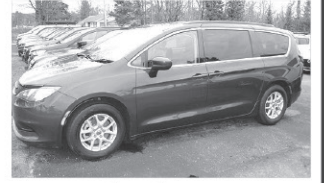
2021 Chrysler Voyager Leather, Stow-N-Go seats, rear camera, 93 K miles. $23,995 As low as $369 a month

2215 US HWY 31 N • PETOSKEY - AT BYRIDER IN PETOSKEY www.NorthFinAutos.com • 231-347-3200