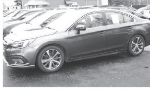
2019 Subaru Legacy AWD, leather, moon roof. $22,995 As low as $349 a month

We have great low mileage cars and vans available for immediate rental at the lowest rates in the area.