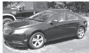
2011 Chevy Cruze 164 K miles. Great MPG. $7,995 As low as $185 a month