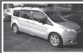
2014 FORD TRANSIT CONNECT XLT 3rd row seat, rear camera, 134 K mi..