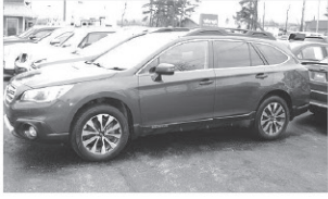
2016 Subaru Outback AWD, PZEV, leather, 171 K miles. $13,995 As low as $279 a month