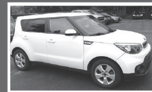
2014 KIA SOUL Rear camera, 106 K miles.