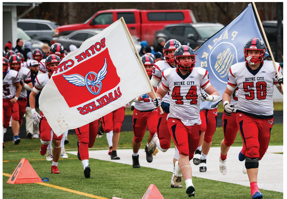
The Ramblers football team runs onto the field in the state semi-finals to the cheers of the huge crowd from Boyne City.

“We played pretty well, and I’m extremely proud of all the kids. They played hard. It’s really disappointing. Good things are going to happen, and bad things