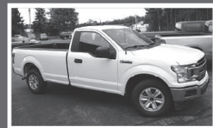
2019 FORD F-150 Tow pkg, bedliner, 111 K mil.