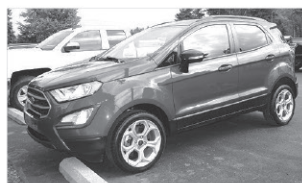
2021 Ford EcoSport SE 4WD, large screen, 54 K miles. Very sharp. $17,995 As low as $285 a month