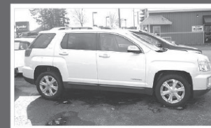
2017 GMC TERRAIN SLT AWD, 135 K miles.