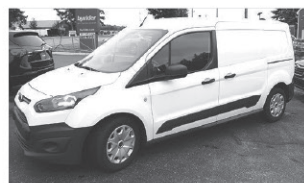
2016 Ford Transit Connect Cargo Van 108 K miles. $16,995 As low as $301 a month