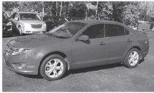
2012 Ford Fusion SE 162 K miles. $7,995 As low as $185 a month