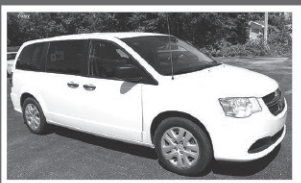
2019 GRAND CARAVAN captain chairs, 7 passenger, Stow-N-Go seats, 107 K miles.