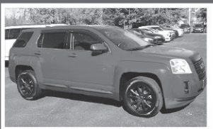
2015 GMC TERRAIN Rear camera, 107 K miles.

We offer good quality used vehicles for everyone, regardless of your credit history. Low down payments and easy financing are available to everyone.