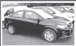
2017 CHEVY SONIC Great MPG, 58 K miles.