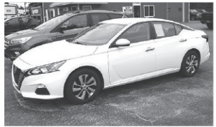
2021 Nissan Altima Rear camera, 65 K miles. Sharp. $17,995 As low as $273 a month