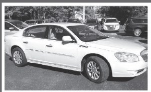
2011 BUICK LUCERNE 113 K miles.