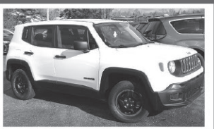
2018 JEEP RENEGADE Sport • 4x4, 134 K miles.