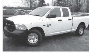
2021 Ram 1500 Classic 4x4, double cab, rear camera, 5.7 L Hemi, 96 K miles. $34,995 As low as $519 a month