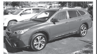
2020 Subaru Outback AWD, leather, tow pkg. $22,995 As low as $349 a month