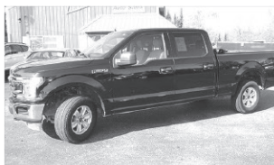
2020 Ford F-150 XLT 4x4, club cab, tow pkg, soft tonneau cover, rear camera, 140 K miles. $25,995 As low as $399 a month