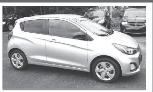
2020 CHEVY SPARK 38 MPG, rear camera, 63 K mi..