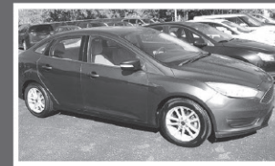
2017 FORD FOCUS Great MPG, 158 K miles.