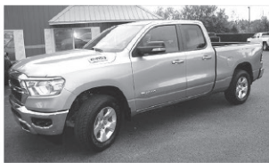
2022 Ram 1500 Lone Star Double cam tow pkg, rear camera, 60 K miles. $29,995 As low as $469 a month